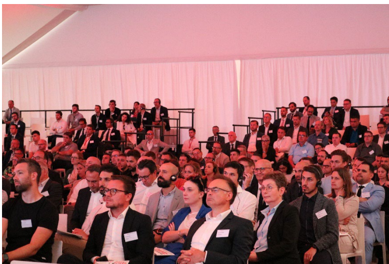
Photo 1: Expert forum C-Parts Management 2023.jpg